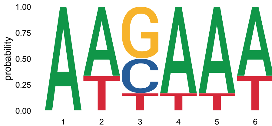
Figure 1: Sequence logo of a Position Probability Matrix